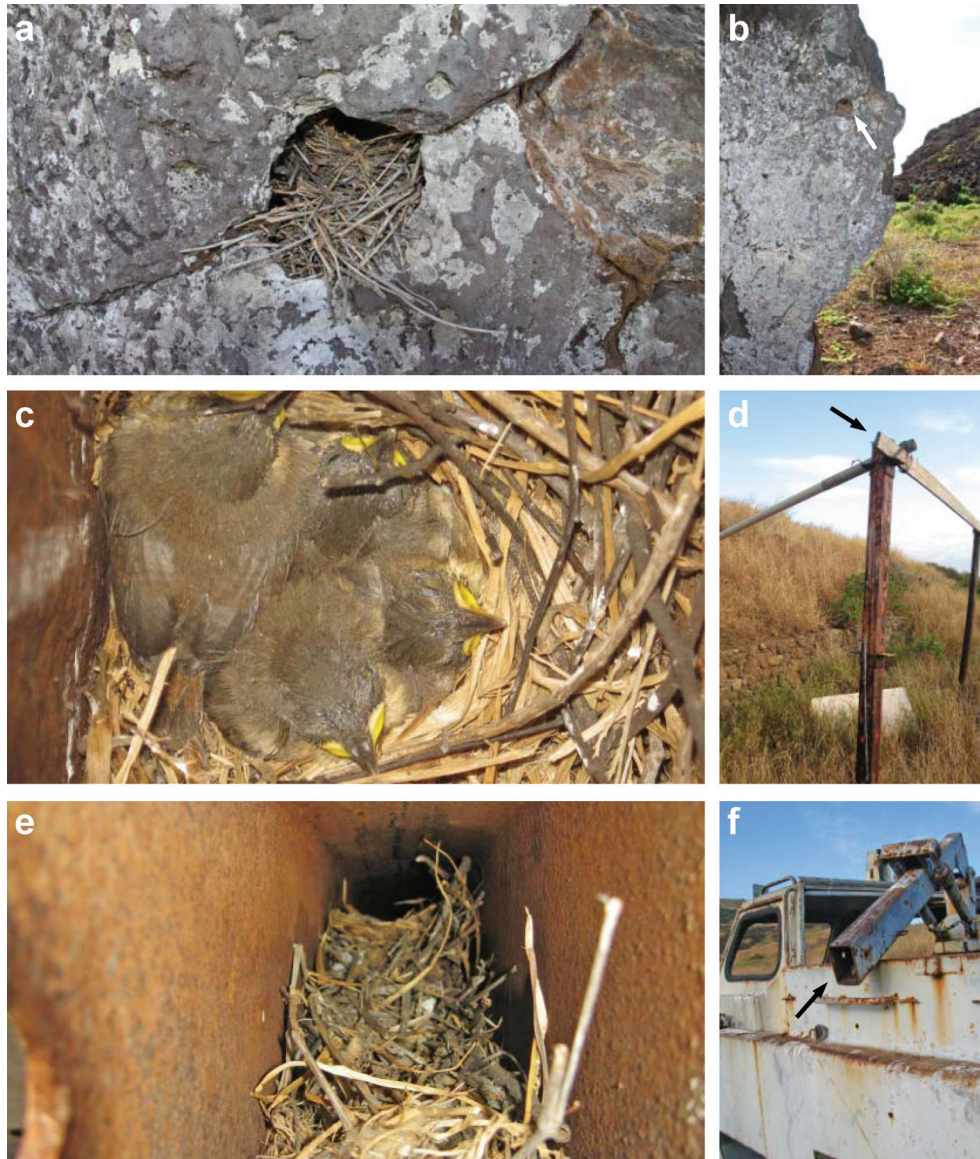
FIG. 2. Photographs of three nests of Clarion Wrens, showing the diverse substrates of nests used by this island-endemic songbird. The pictures reveal diverse substrates used by wrens: (a, b) a nest in a cavity in volcanic rock; (c, d) a nest inside a metal tube; (e, f) a nest inside an abandoned vehicle. Arrows show the entrance of the nests.

not restricted to cavities. Furthermore, the diversity of nests we found (e.g., Fig. 2) suggests that this species' nesting behavior is quite versatile with respect to nest placement.