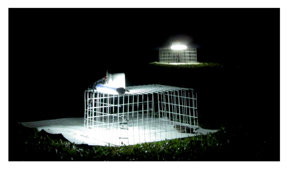
Figure 1. Experimental feeding-stations. Stations used to test the effects of conspecific presence on feeding responses of free-ranging cane toads. Note the captive toad in the foreground, providing a social stimulus. doi:10.1371/journal.pone.0102880.q001

will take less time to leave the shelter [31,32,33]. At 2000 h on the evening after the night of its capture, each toad was placed singly under a shelter in a large plastic container ( 115 \times 115 cm floor area). The shelter was an inverted plastic bucket (27 cm in diameter, 25 cm high) with a 6 \times 9 cm door facing the center of the enclosure. To allow each toad to settle down, the door was kept closed for the first 5 min of each trial. After this period we opened the door and video-recorded the toad's activity over the next 60 min. Trials were run in near darkness, with a red light for illumination. From the video, we measured the time taken for the toad to fully exit the shelter. Only those toads that settled down during the 5 min acclimation period were tested (N = 63 out of 95 collected during the field experiments).